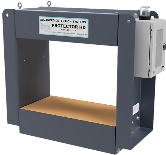
SurroundScan Protector HD Metal Detector