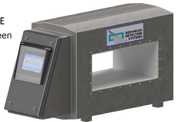
SurroundScan Defender III

For the past 30 years, Advanced Detection Systems has been developing SurroundScan technology so that each system performs reliably in the presence of power fluctuations, radiated noise and system vibration. In addition, Advanced Detection Systems developed patented state-of-the-art electronics that provide easy setup in the most demanding locations. The result is performance reliability that meets your processing demands.