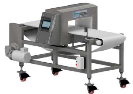
PROSCAN CONVEYOR SYSTEM