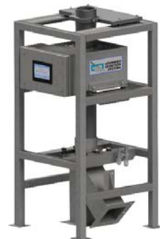
PROSCAN GRAVITY DROP SYSTEM