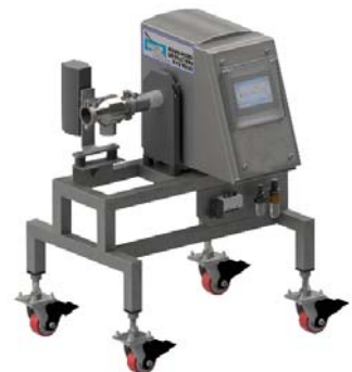
PROSCAN PIPELINE SYSTEM