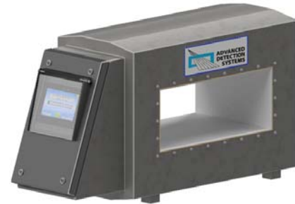
SURROUNDSCAN DEFENDER III