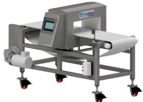
SURROUNDSCAN DEFENDER III & CONVEYOR SYSTEM