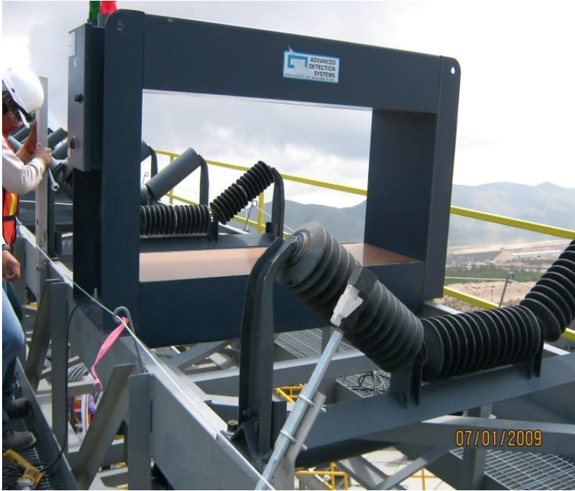
Polymer rollers installed at the edge of the 48" metal-free zone on an inclined conveyor, Mexico.

be removed, then replacement with non-magnetic polymer idlers is recommended. Safety rails or other overburden devices must be replaced with non-magnetic materials such as wood, PVC or fiberglass. Any metal within the metal-free zone will upset the balance of the field and compromise the detection levels of the unit.