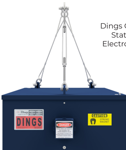
Dings Overhead Stationary Electromagnet