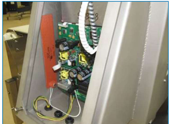
ProScan Touchscreen Heater installation

The control box heaters used in Advanced Detection Systems metal detectors are flexible 110V resistive pads with built in thermostat controls and an adhesive backing. The heater is wired directly into the detector's power supply and requires no additional power source or user input to operate.