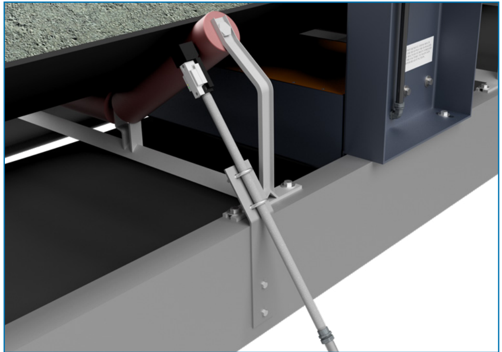
Splice Sensor Installed on Troughed Belt Conveyor