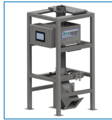
ProScan Gravity Drop System