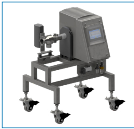
ProScan Pipeline System