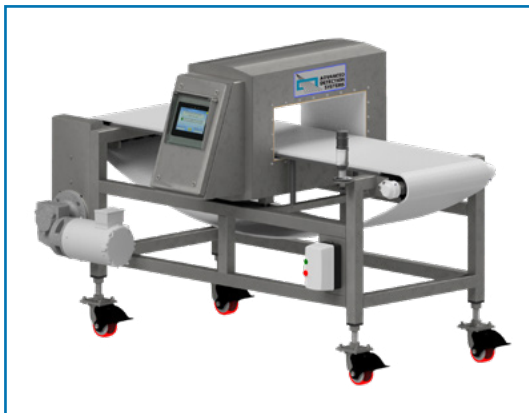
ProScan Conveyor System