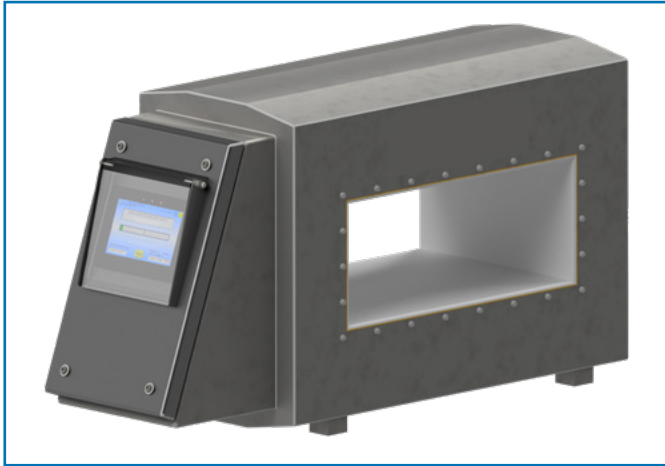
SurroundScan Defender Head