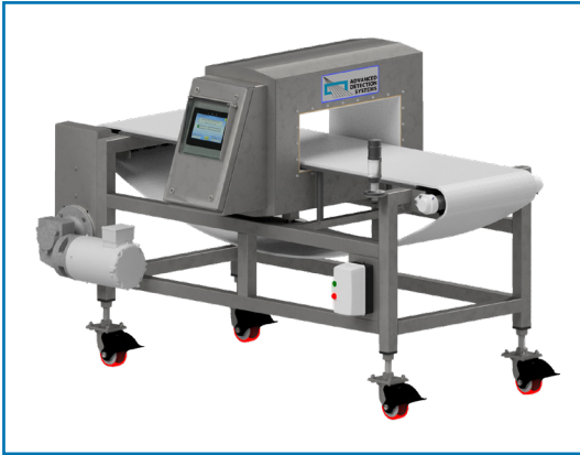
ProScan Conveyor System