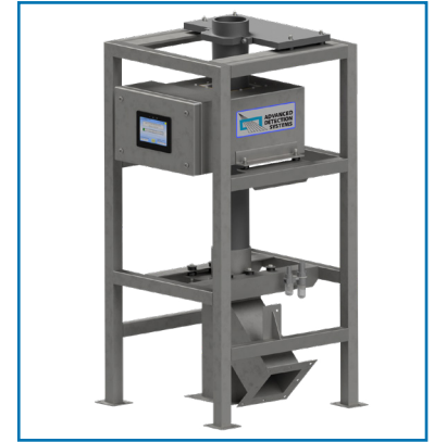
ProScan Gravity Drop System