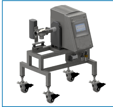
ProScan Pipeline System