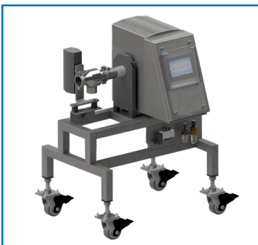
ProScan Pipeline System

Certified Test Pieces are primarily used with the metal detectors shown below