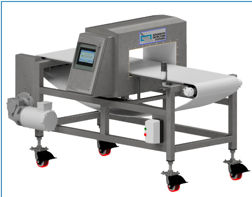
ProScan Conveyor System