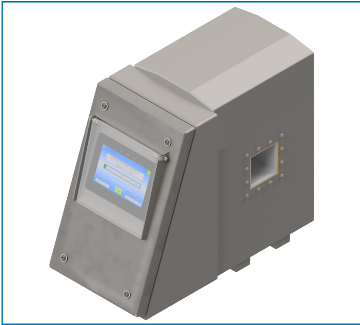
ProScan Max III Head