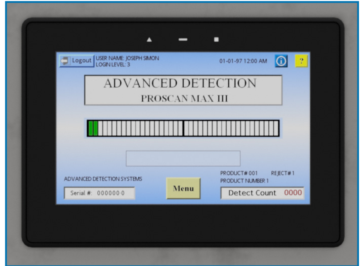
ProScan Max III Touchscreen

Water-tight sealing, as well as impact resistant touch screen cover; ensures equipment protection